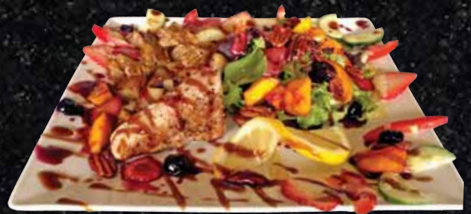
Wild Caught Seared Yellowfin Ahi Tuna Platter $39