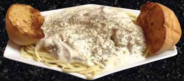
Chicken Alfredo Pasta with French Roll $20