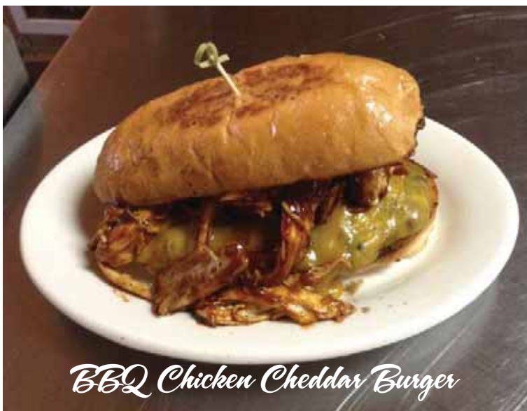
BBQ Chicken Cheddar Burger