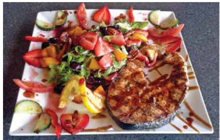
Fresh Cut Salmon Platter w/ Caramelized Mango Salad $29.99