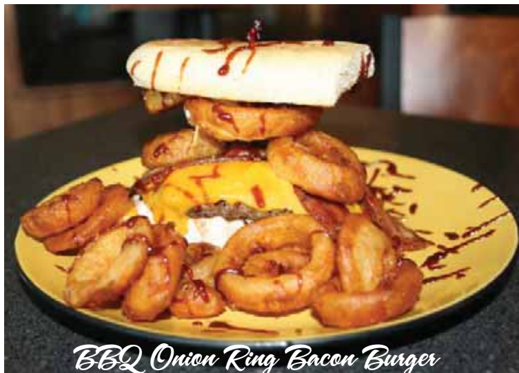
BBQ Onion Ring Bacon Burger