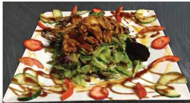
Teriyaki Chicken Salad