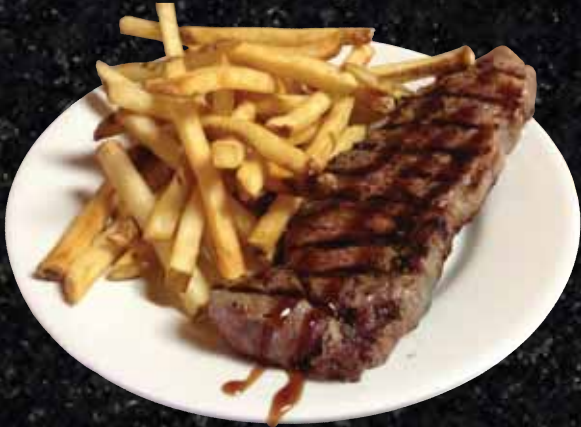
Choice 8 oz New York Strip Steak with Gourmet Fries $20