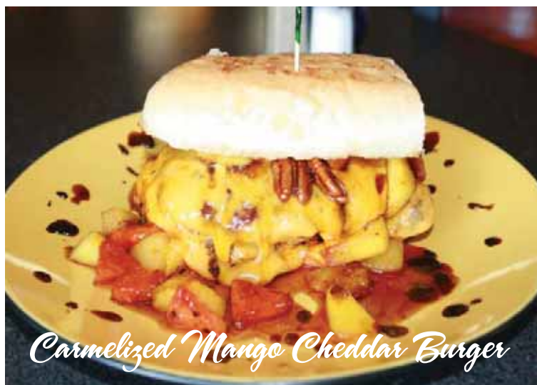
Caramelized Mango Cheddar Burger