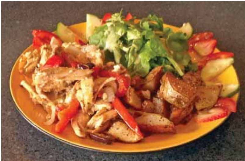
Grilled Greek Chicken Platter w/ Tuscan Potatoes n' Salad $19.99