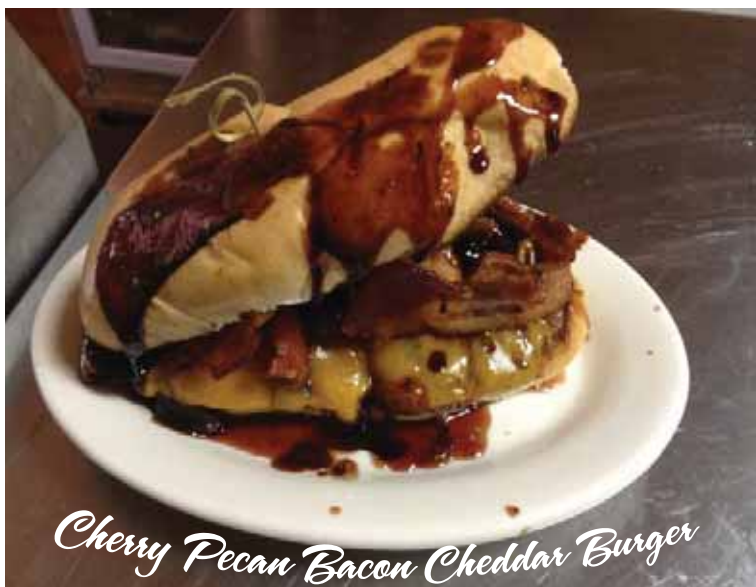
Cherry Pecan Bacon Cheddar Burger