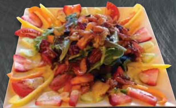
Caramelized Mango Salad