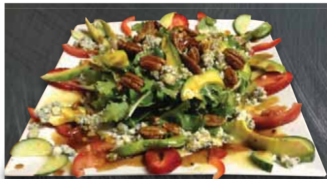
Avocado Blue n' Pecan Salad