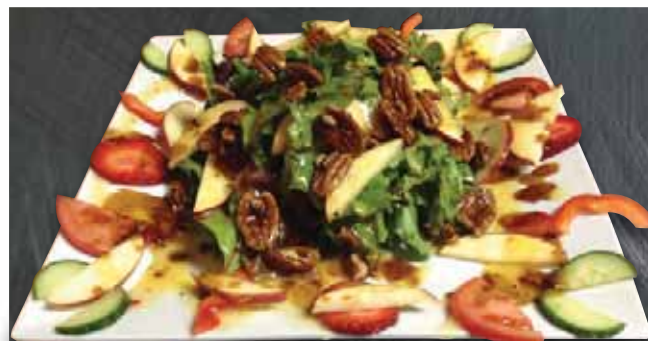
Apple n' Caramelized Pecan Salad