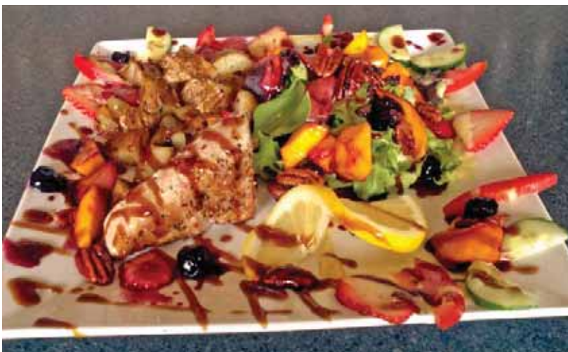
Sushi Grade Seared Yellow Fin Ahi Tuna Platter $29.99