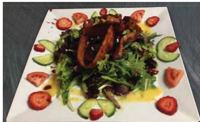
Bacon n' Cherry Salad