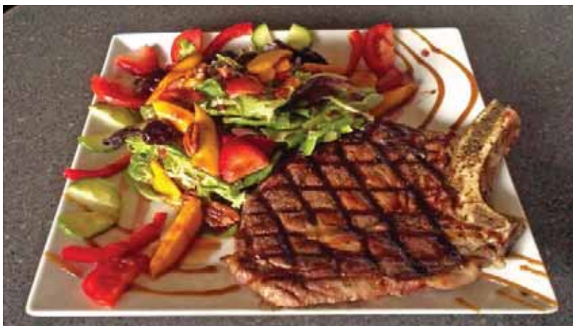
16oz USDA Certified Prime Grade Ribeye Platter $49.99, Ala Carte $34.99