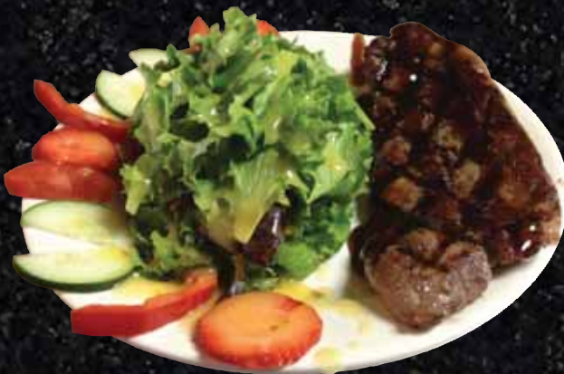
Choice 8 oz New York Strip Steak with Organic Salad $30