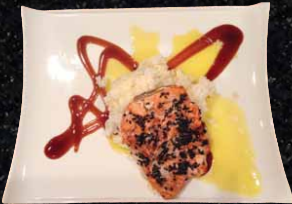
Wild Caught Copper River Salmon with Rice $30