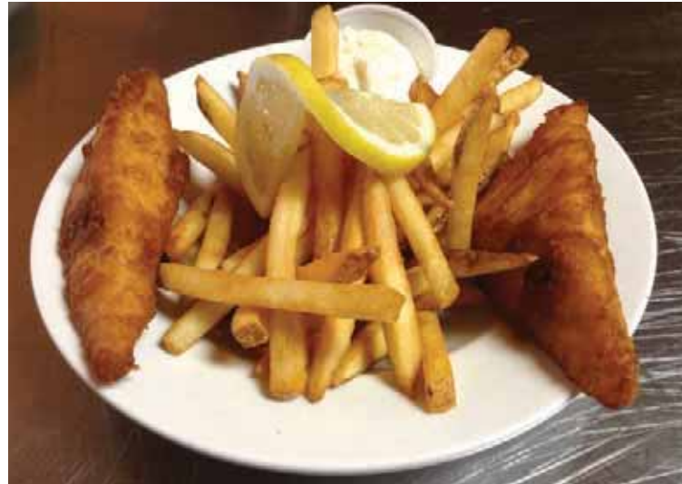
Beer-battered Wild Alaskan Halibut Fish n' Chips $17.99