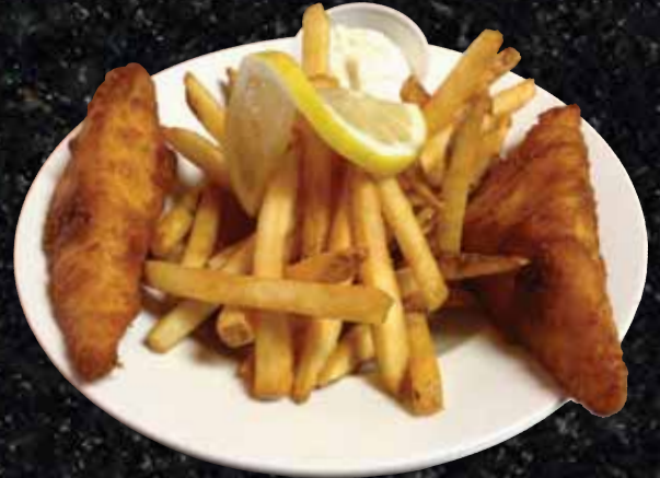
Beer Battered Wild Caught Alaskan Cod Fish & Chips $16