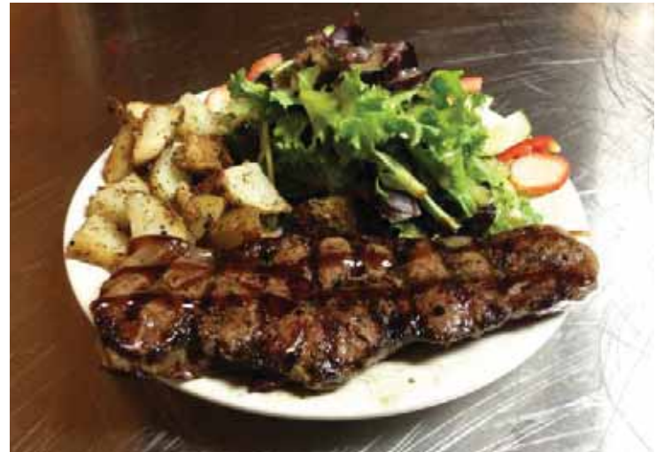
8oz New York Strip Platter w/ Tuscan Potatoes n' Salad $19.99